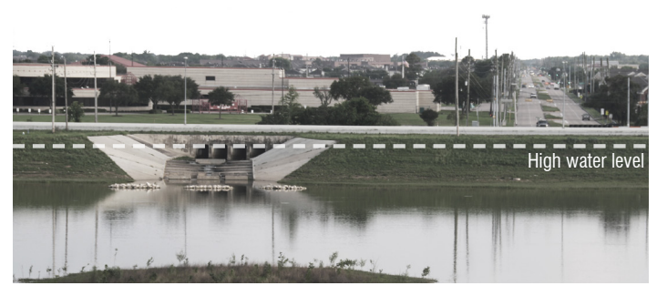
Figure 2 Regional Detention