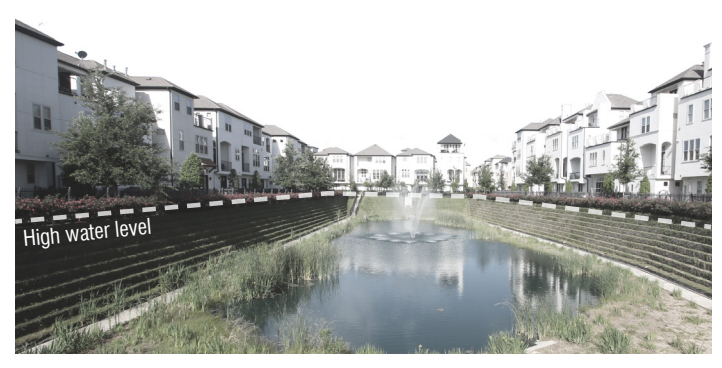
Figure 1 On-site Detention

Detention basins hold certain volumes of water, calculated for peak flowrates to match pre-development levels. They are typically designed to hold water for 24hr rainfall events, but different duration goals affect the size of the detention basin. Other factors that affect the design volume include rain intensity, size of drainage area, and Low Impact Development practices. Once required detention volume is determined, the width, length, and depth of the basin can be designed.